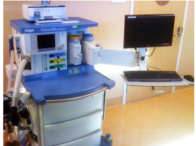
MD Arm with Paralink, monitor and keyboard on a Draeger anesthesia cart.