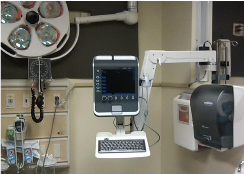
SonoSite S-Fast Ultrasound Machine mounted on an Elite Double Arm. This setup can be shared between two trauma bays in the Emergency Department.