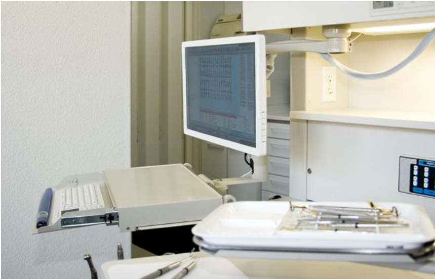
Undercabinet workstation with WorkSurface Keyboard Tray.