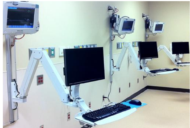
Philips monitors on wall tracks with Elite Double Arm mounts supporting monitors and keyboards.