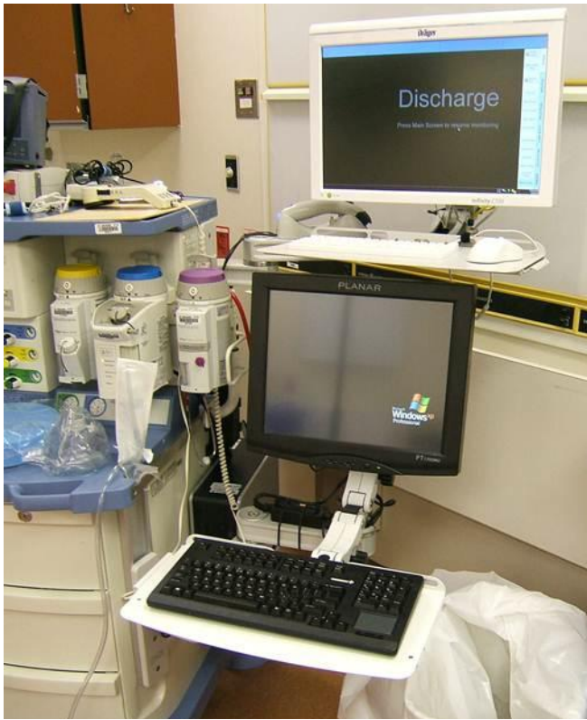
Dual monitors, scanner and service tray supported by Titan Arms on an anesthesia cart.

ICW's in-house engineers work with you to define, create and test your mounting solution.