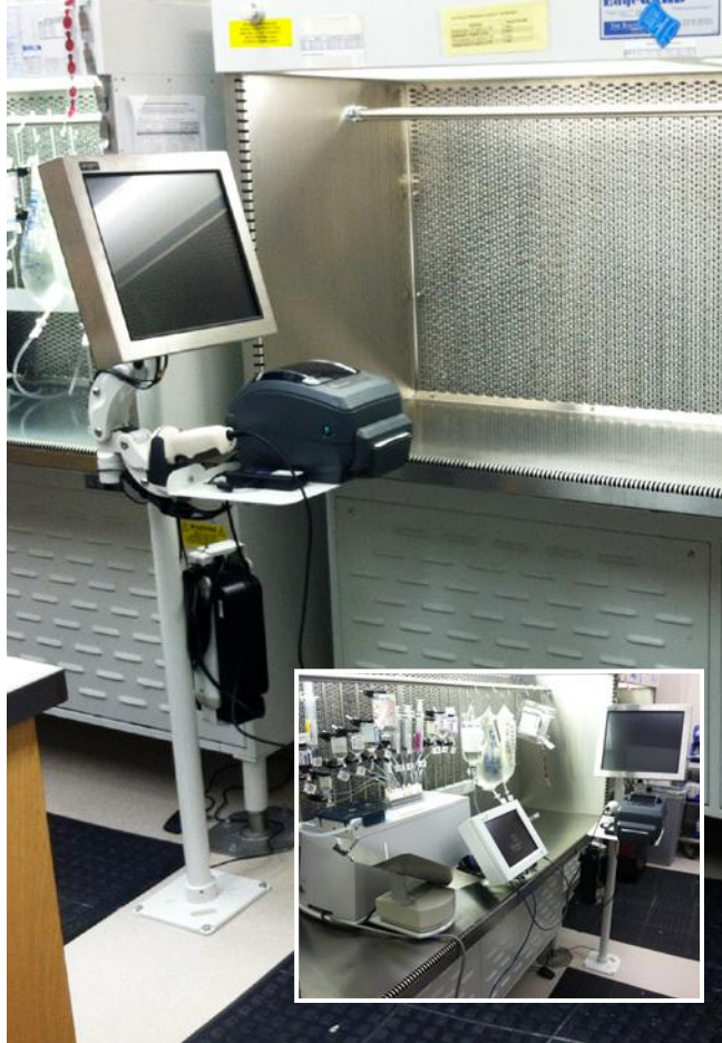
Ultra Pole Mount configuration for Baxter DoseEdge Medication Delivery System in a pharmacy clean room. The mount holds a touchscreen monitor with scanner and Zebra printer .