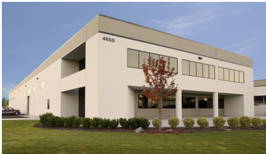
Grumman Building: Assembly and Shipping