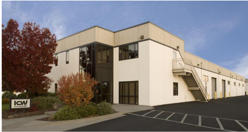
Kingsley Building: Administration, IT, Engineering and Manufacturing

Watch a video tour of our plant at www.icwusa.com