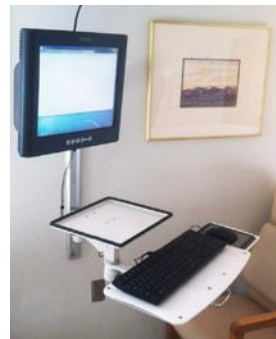
Monitor, service tray and keyboard on Ultra Arm wall track system.