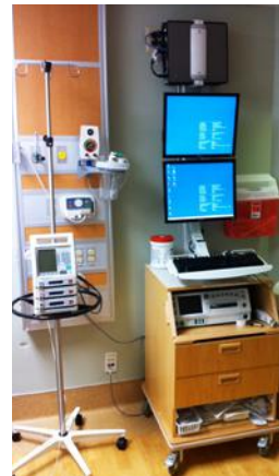
Dual monitors on a fetal monitor cart.