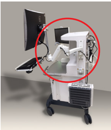
UL180EV7-W3-KUB-A1 A track mounted Ultra 180 arm supports the computer workstation on a Mindray A7 Anesthesiology Workstation.