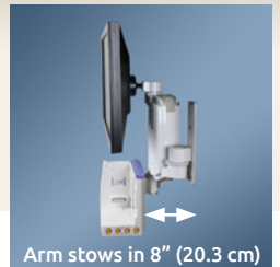
Arm stows in 8" (20.3 cm)

ICW's versatile Ultra 180 arm configured with a Drop Post to support a Nihon Kohden LifeScope G9 mobile monitor.