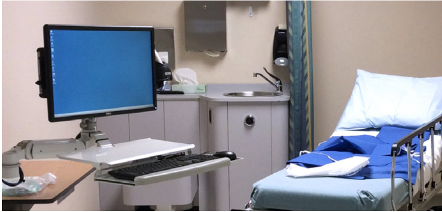
PRE-OP with ICW Ultra 180 arm: Fully articulating computer mounting arms enable patients to view their own records and participate in their own care.

“Patient satisfaction is strongly influenced by the amount of time nurses remain in the room.”