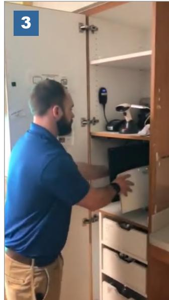
3 Although cabinet corridors are tight, the workstation effortlessly stows up and slides back in.