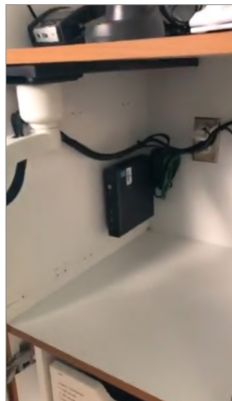
Despite lack of compartment space, the workstation, wires and CPU fit with room to spare.