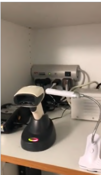
The closet's upper shelf houses accessories and provides a place for organized wire management.