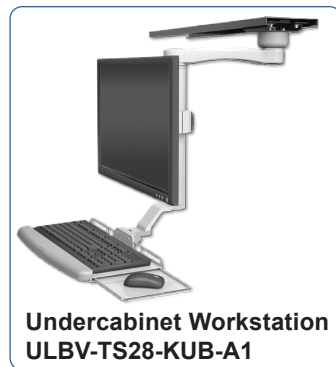
Undercabinet Workstation ULBV-TS28-KUB-A1

Saving space to make your work environment more efficient, comfortable and roomier is one of our specialties and missions.