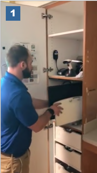
1 ICW's undercabinet workstation uses a track attached to the underside of the shelf.