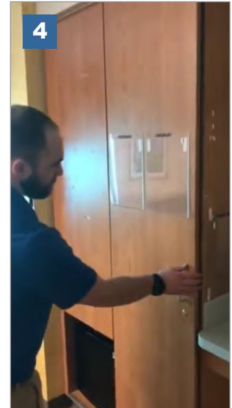
4 ICW's modular designs will provide you with the best solution. Call us for a customized design.